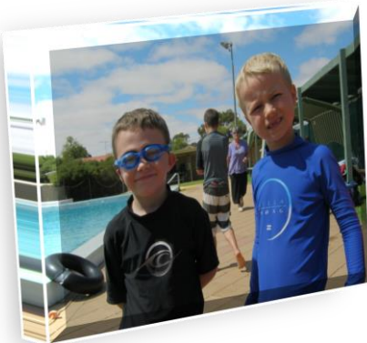
Pic from the Past